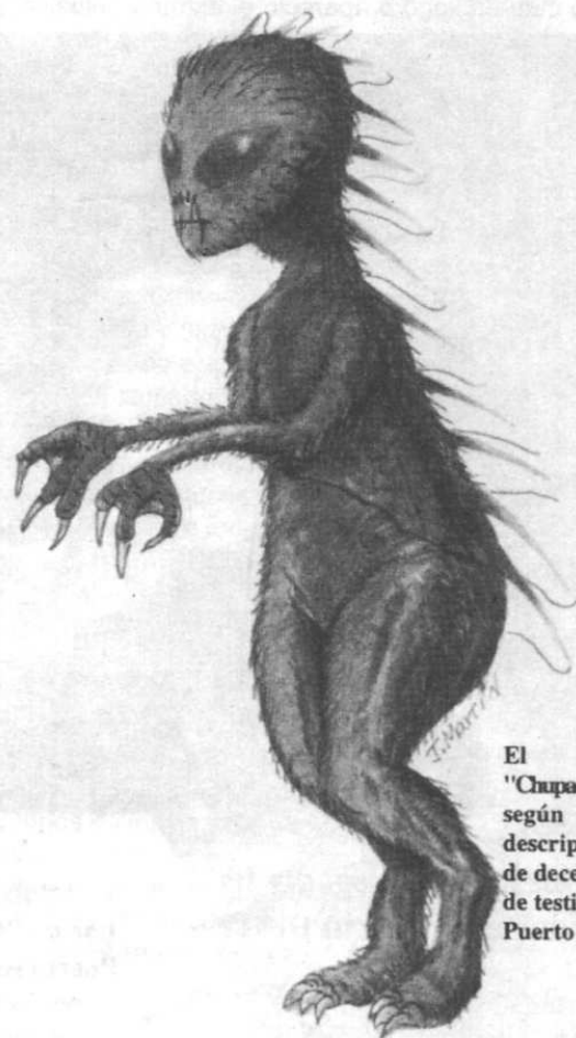
El "Chupacabras" según descripción de decenas de testigos en Puerto Rico.