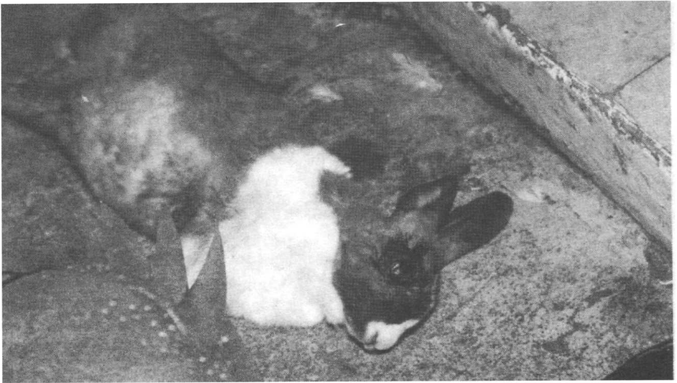
Rabbit killed, allegedly by a chupacabra, in Trujillo Alto, Puerto Rico. Note the perfectly circular aperture in the region of the animal's eye, which is characteristic of these attacks.