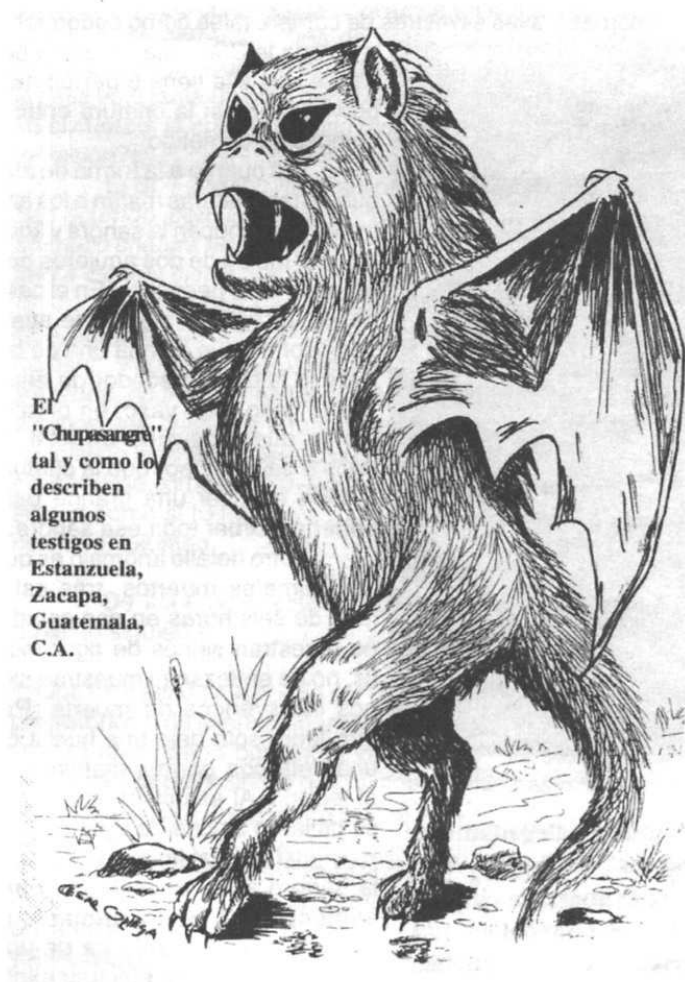
El "Chupasangre" tal y como lo describen algunos testigos en Estanzuela, Zacapa, Guatemala, C.A.